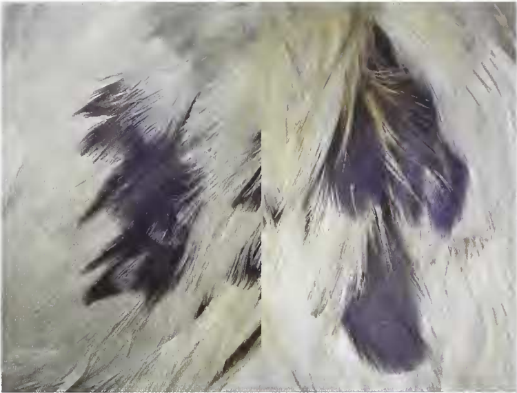
Figure 20. ‘Shoulders’ (left and right side) of Liverpool specimen of Lord Howe Gallinule Porphyrio albus (WML D3213) showing a few remnant purple-blue feathers, a colour not found in the shoulder/upperparts plumage of any subspecies of Purple Swamphen P. porphyrio (Hein van Grouw)

The most striking difference between P. albus and other Porphyrio , except P. p. melanotus , is the short middle toe, which is especially reduced in the Liverpool specimen. In all other P. porphyrio subspecies, the middle toe is the same length or even slightly longer than the tarsus, but in P. p. melanotus , however, the middle toe is shorter than the tarsus, just as in P. albus . The tail of the Vienna